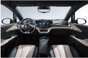
Black and brown