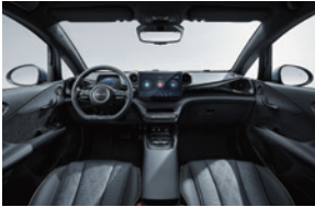
Black and grey